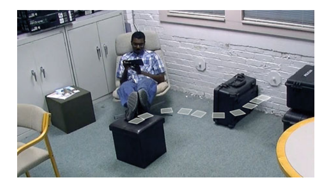
Fig. 3 A typical path taken to approach a seated person. Squares represent the ottoman's position, one second apart