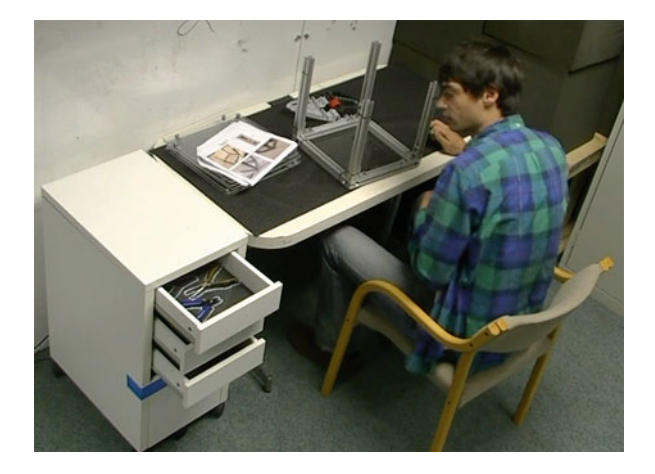
Fig. 5 Emotive drawers performing an animation gesture while a human collaborator assembles a cube puzzle

The emotive robotic drawers are designed to help us explore how a robot can participate in an iterative, turn-taking activity with a human collaborator, using its movements alone. The shared activity can be any task where the human needs repeated access to objects stored within the robot's drawers, and where it can open and close in ways that encourage and support task completion. The example that we explored most closely is a cube assembly puzzle (see Fig. 5), which requires six different fasteners, and where the drawers contain all of the tools required to build the cube Mok et al. (2014, 2015).