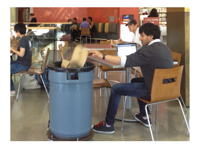
Fig. 7 A lunchtime diner discards his trash into the roving trash barrel after it approached and gestured to draw his attention

We built and tested a roving trash barrel robot to better understand the implicit social protocols, cues and signals of public interactions between people and robots, and to produce movements and actions that people can understand. In eight lunch-time sessions, spread across two heavily populated campus dining destinations, we piloted the robot in Wizard-of-Oz fashion through crowded public areas, initiating and responding to requests for impromptu interactions around collecting people's trash (see Fig. 7).