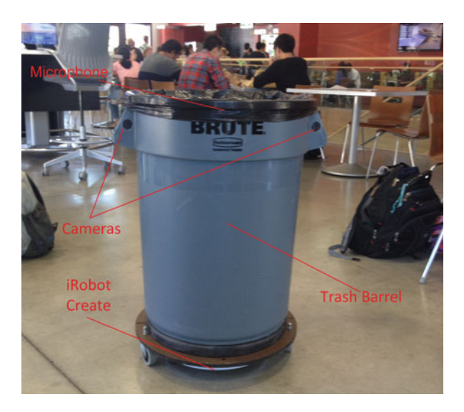
Fig. 8 A standard Rubbermaid Brute trash barrel is mounted atop an iRobot Create platform. A laptop computer, hidden within the trash barrel, handles video and control commands

A researcher remotely controls the robot (Fong and Thorpe 2001), issuing commands over a web interface to a remote server, which relays the control commands over WiFi to the laptop, and then by USB to the robotic base (see Fig. 9). The interface shows the operator two video streams from the cameras in the robot's handles. The choice of teleoperation over autonomous control provides flexibility for real-time improvisation, and permits responsive behaviors to unanticipated events.