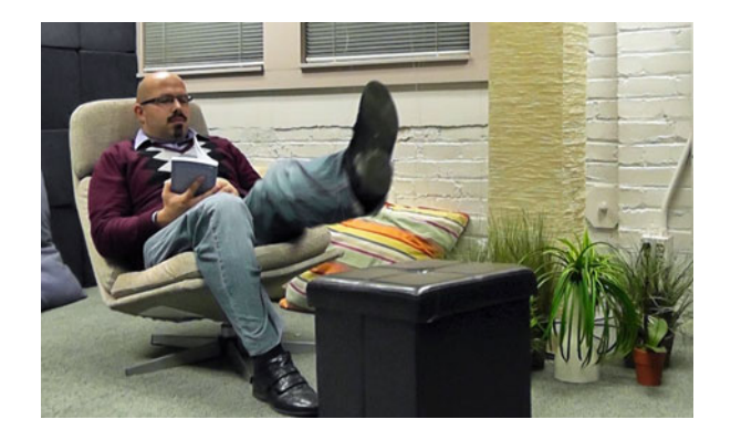
Fig. 1 A participant in an improvisation session accepts the ottoman's offer to support his feet